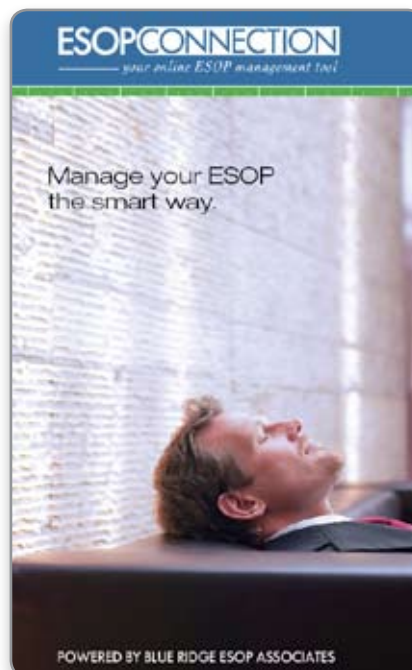
Brochure cover for ESOP and 401k administration services.

Further additions include tracking which users login, a process to allow users to opt-in to electronic notification of new documents and the accompanying legal forms to allow that, as stipulated by the DOL and IRS, the ability to export the list and to email those that consented to use electronic notification.